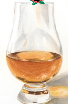
Commemorative Club Molisani Glencairn Glass