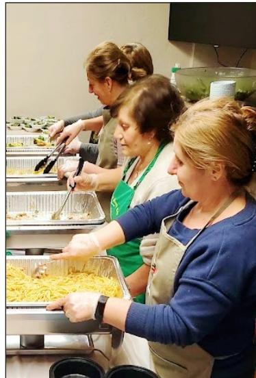
Not the first time we've seen this picture.