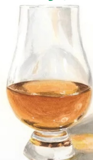
Commemorative Club Molisani Glencairn Glass