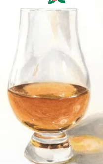
Commemorative Club Molisani Glencairn Glass